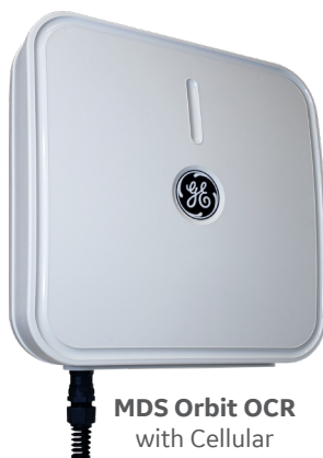
MDS Orbit OCR with Cellular

A Wi-Fi radio option can be selected as a standalone, or as a secondary radio for licensed, unlicensed, or cellular radios. MDS Orbit offers two versions of Wi-Fi to meet performance and cost requirements. A 802.11 b/g/n 2.4 GHz Wi-Fi option supports up to seven clients/hosts per AP. A 802.11 a/b/g/n 2.4/5 GHz option provides enhanced dual antenna (MIMO) performance and 32+ clients per AP.