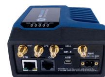
MDS Orbit ECR with Cellular and Wi-Fi