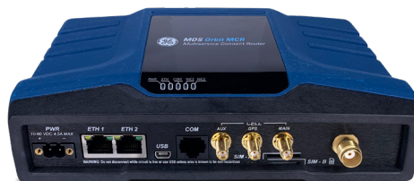
MDS Orbit MCR with Cellular and 900 MHz