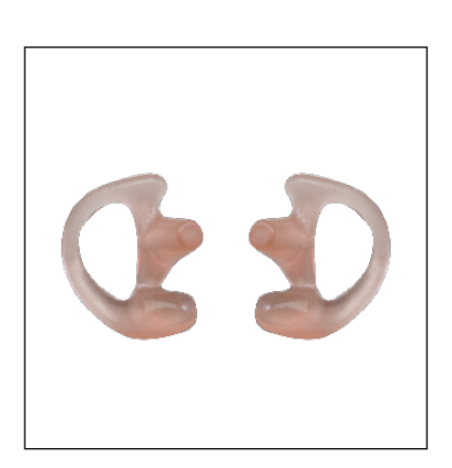
Optional: Skeletal open ear inserts for acoustic tubes holds the tube in place without blocking the ear

allows the user to privately receive incoming calls on their two-way radio. The Acoustic Tube earpiece has a high performing speaker with clear sound, a coiled cable and a 3.5mm jack connector for Remote Speaker Microphone integration.